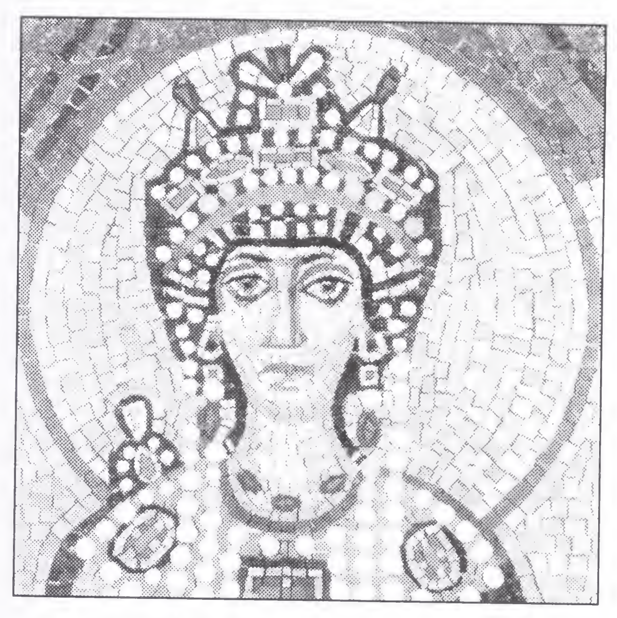
Queen Theodora Syriac Empress of Byzantium (523-548)