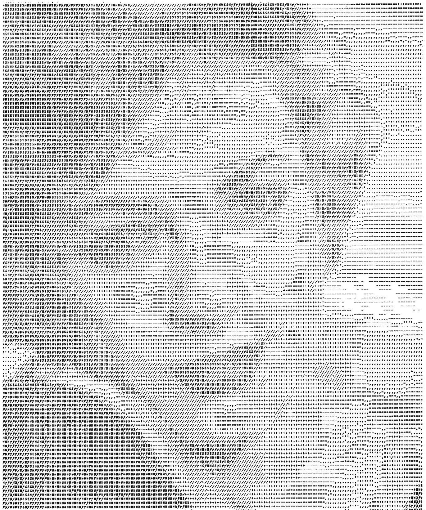
Fig. 4 - Portrait reproduced from paper tape on a computer line printer using a grey-scale of variable character density (Reproduced by kind permission of Professor P.S. Brandon, Cambridge University)